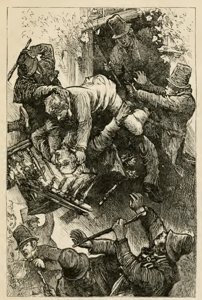
"THE BALCONY CREAKED AND TREMBLED, AND AT LAST GAVE WAY."

"Touch me if you dave; only lay one finger